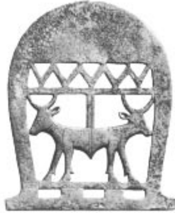
Figure 2. Bronze parade axe.

reject both Yahweh and his prophet Moses and return to Egypt to serve the Egyptians (and therefore the Egyptian gods as well). During the revolts at Rephidim and Kadesh Barnea the Israelites were on the verge of stoning Moses to death when Yahweh personally intervened and stopped the revolts. 12 At Mount Sinai the people went so far as to build an image of a twin-headed, golden bull, calling it Yahweh. 13 This idol was conceived out of pagan bull worship common in Baalism throughout the Middle East, the Apis and Horus bulls being part of the Baal ritualistic practice in Egypt from whence the Israelites had recently come. 14 An example of this type of idol was found on an axe head from Egypt dated to a period earlier than the XVIII Dynasty (see figure 2). 15